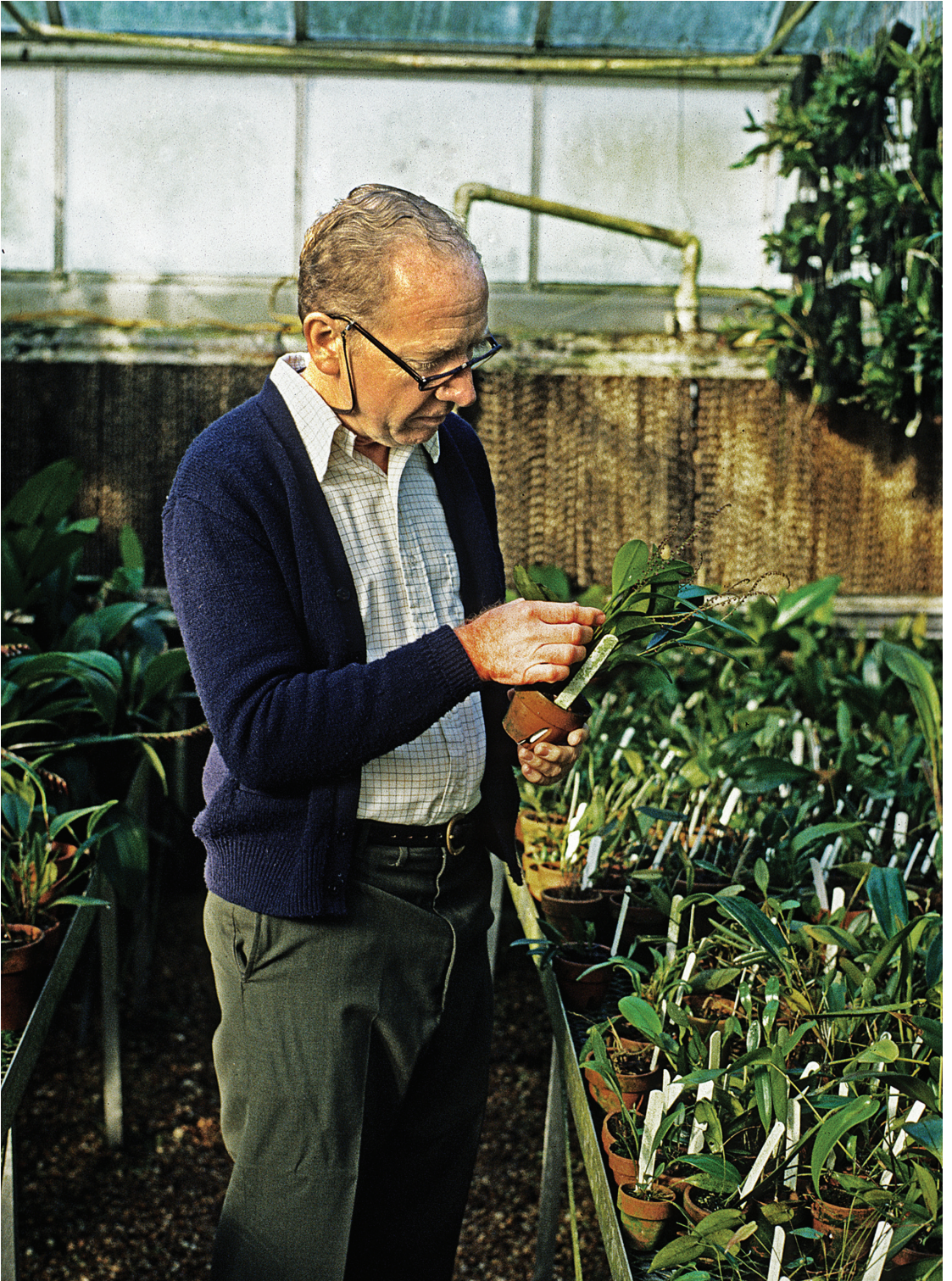
Inspecting some of his pleurothallid collection, cultivated at Selby Gardens, 1981–1982.