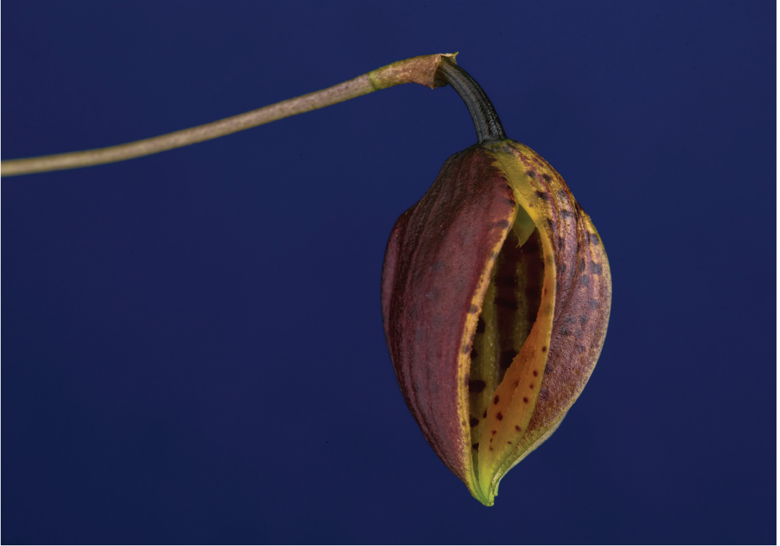
Luerela pelecanceps , from the Lankester Botanical Garden living collection.